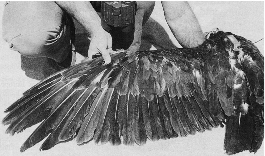
Plate 98. Spotted Eagle Aquila clanga fitted with platform transmitter terminal, Saudi Arabia, October 1993 (B.-U. Meyburg)

For the computer calculations of distances covered between Argos locations, we used an integrated global mapping system displaying a true Mercator projection. For plotting the breeding area in western Siberia and the stop-over areas in Saudi Arabia, coloured maps of the Russian ordnance survey with a scale of 1:200,000 were used, and for the winter quarters in the Yemen a map with a scale of 1:250,000.